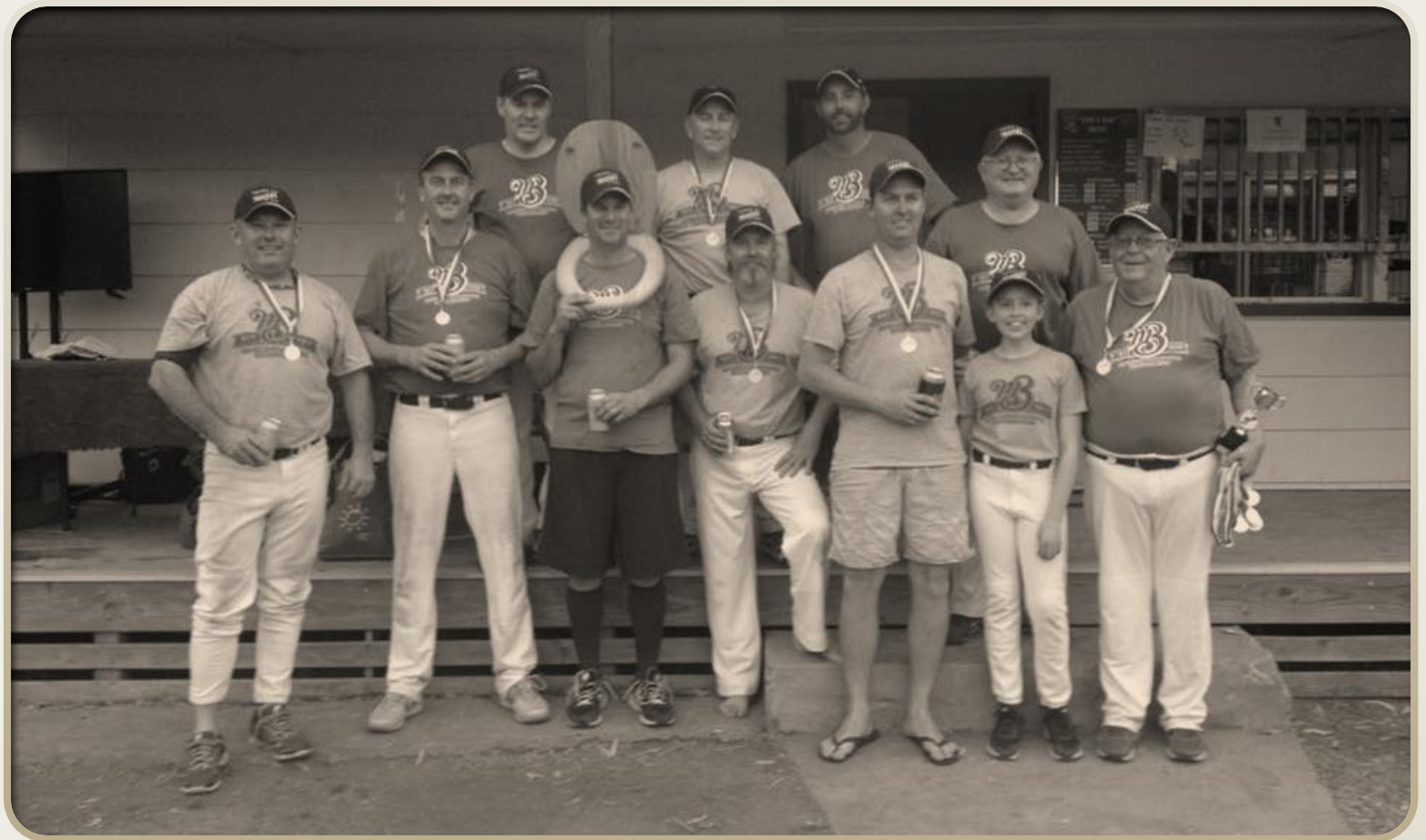
Mayfield Boomerangs Masters