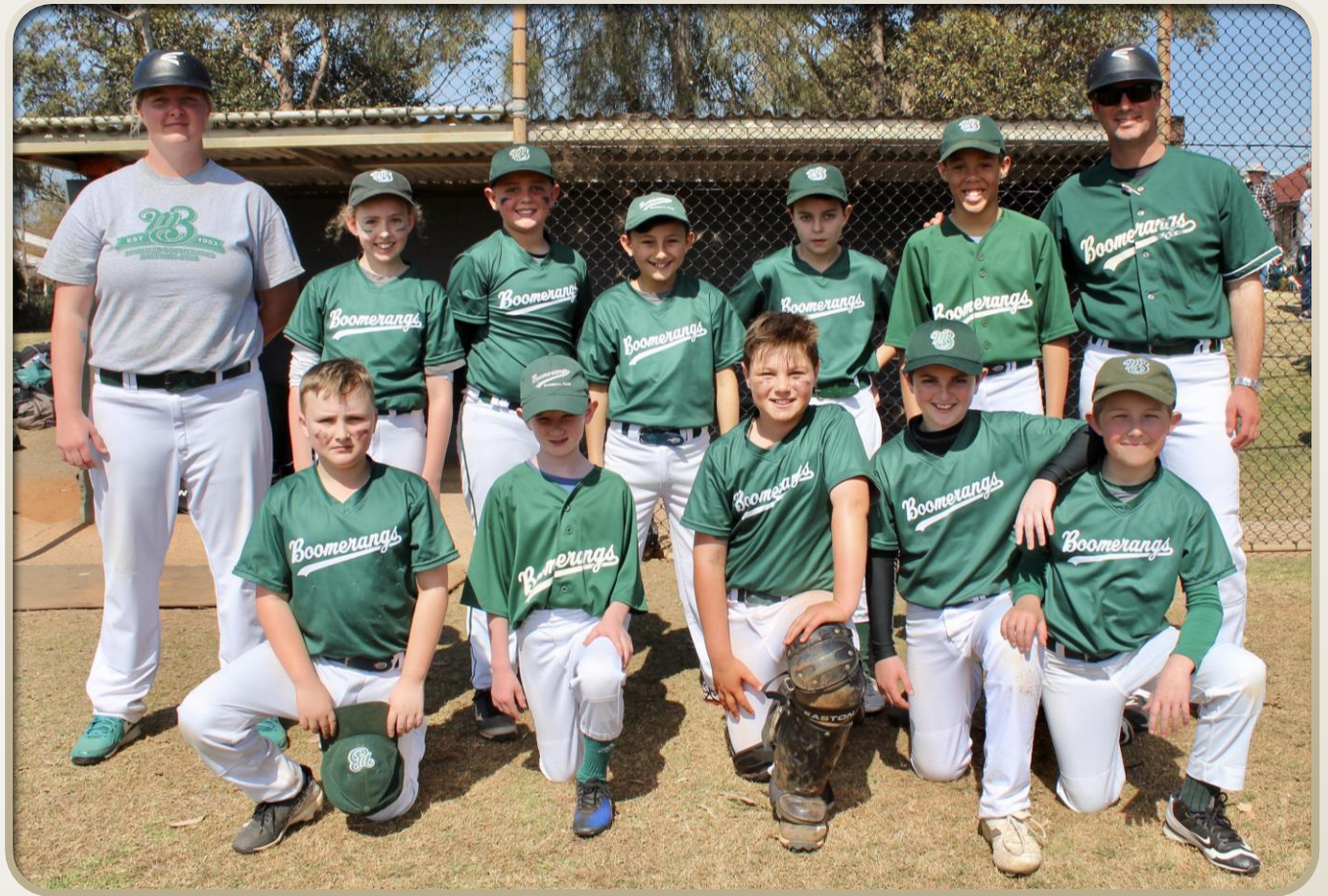
Mayfield Boomerangs Juniors